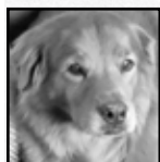
19-040 Duke Hester