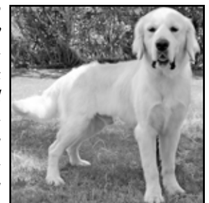
"Show dog" Fin

had set up barriers on the bed to keep the dogs from climbing up. Lilly managed to jump onto the bed anyway, pull back the comforter, drag a silk pillowcase to the center, and curl up for a nap as if it were her rightful throne! Fin , on the other hand, is our fun-loving boy with his big "polar bear" paws and endless eagerness to play. But despite being a retriever, swimming is not at the top of his fun list. We've tried many times to teach him, but he tends to forget about using his back paws. He'll dogpaddle enthusiastically with his front legs while his back end sinks, leaving him bobbing