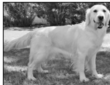
"Show dog" Lilly