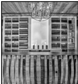
Elegant Aridus wine tasting room at 7173 E Main Street in Old Town Scottsdale