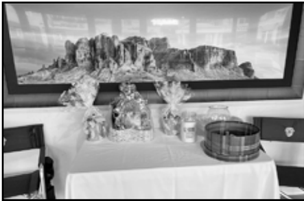
Our check-in table with the cork raffle was located just inside the Gallery's front door, right in front of a stunning full-color photo of the Superstition Mountains taken by Jon Wendell

taseo monitored the food, adding more appetizers and delicious sweets as needed. Unlike last year when we offered only sweet dessert items, this year we had ingredients for attendees to make their own charcuterie cups – and we had champagne-style cups, too!