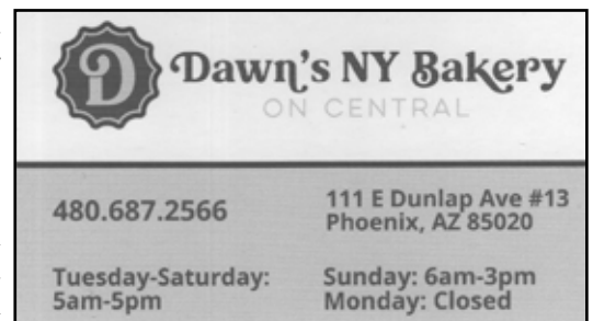
111 E Dunlap Ave #13, Phoenix, AZ