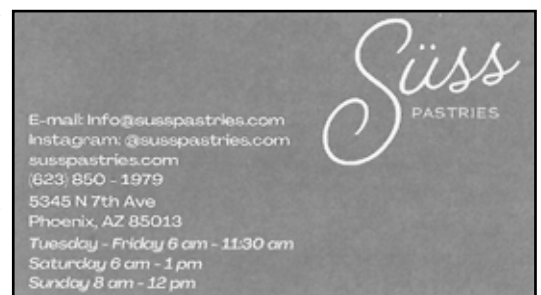
5341 N 7th Ave, Phoenix