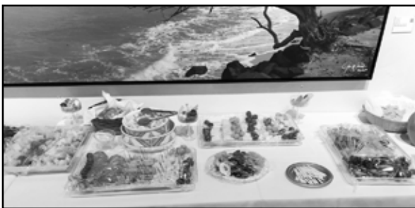
The attractive arrangement of foods on the charcuterie table was very inviting