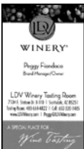
LDV Tasting room is located at 7134 E. Stetson Drive; #B110 (south of Camelback Rd, west of Scottsdale Rd at SouthBridge)

activities by taking memorable photographs. As last year, we had a delightful power point presentation of past AGR -rescued dogs that was created by Connie!