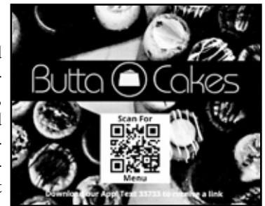
20801 N Scottsdale Rd, Ste 107, Scottsdale