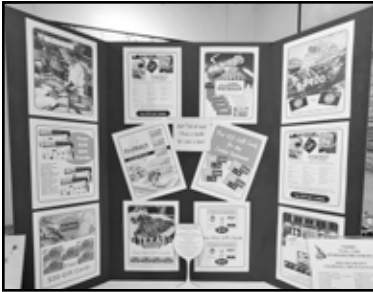
Connie's most impressive graphic creation was the large 3-fold sign for our very popular Eat Out at Least Once A Month For A Year – this item included $100 gift cards for many restaurants; some of the gift cards ( Synergy , especially) could be used in more than one place, making them very useful! After a bidding war, it sold for its full value of $1,250!