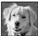
19-071 Sophie Finch