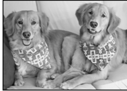
25-041 Stormy and 25-042 Thena now Zena

25-041 Stormy and 25-042 Thena are a mother-daughter pair of AKC Golden Retrievers with very different personalities, yet they are inseparable. Their former owner, who loved them dearly, was