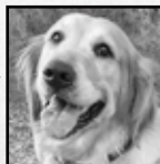
16-048 Rainey Dufrene