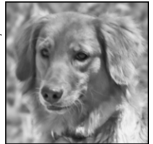
25-041 Stormy above; 25-042 Zena below