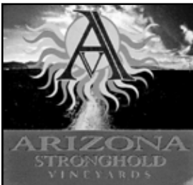
Arizona Stronghold tasting room is located at 4225 N Marshall Way in Old Town Scottsdale