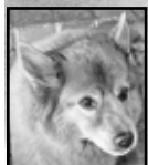
15-047 Emma Gutekunst