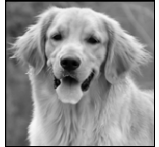
25-045 Spam all grown up