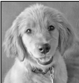
25-045 Puppy Spam at Intake

24-045 Spam is a 1-year-old female Golden Retriever with a heart as golden as her coat. She was surrendered by a service organization due to medical needs that required ongoing care they couldn't provide. Her medical story is long and ongoing, but in short, she is a special needs dog born with a liver shunt: abnormally-formed vessels allowed normal blood, which drains from the digestive system, to bypass